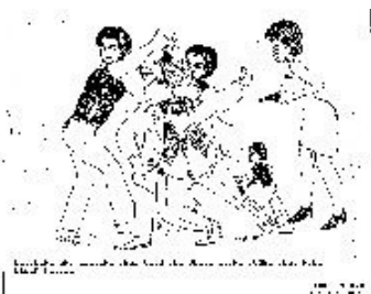
Click for full size picture. (12K)